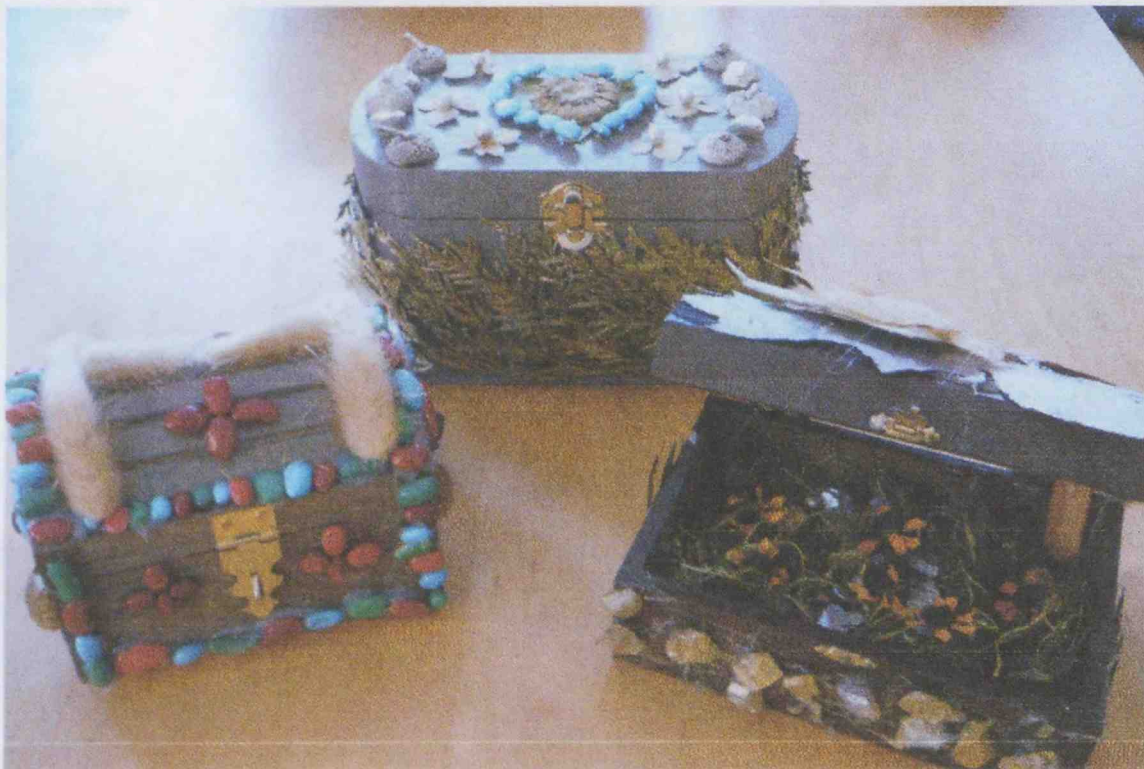
Treasure Chests for the GCNJ Flower Show