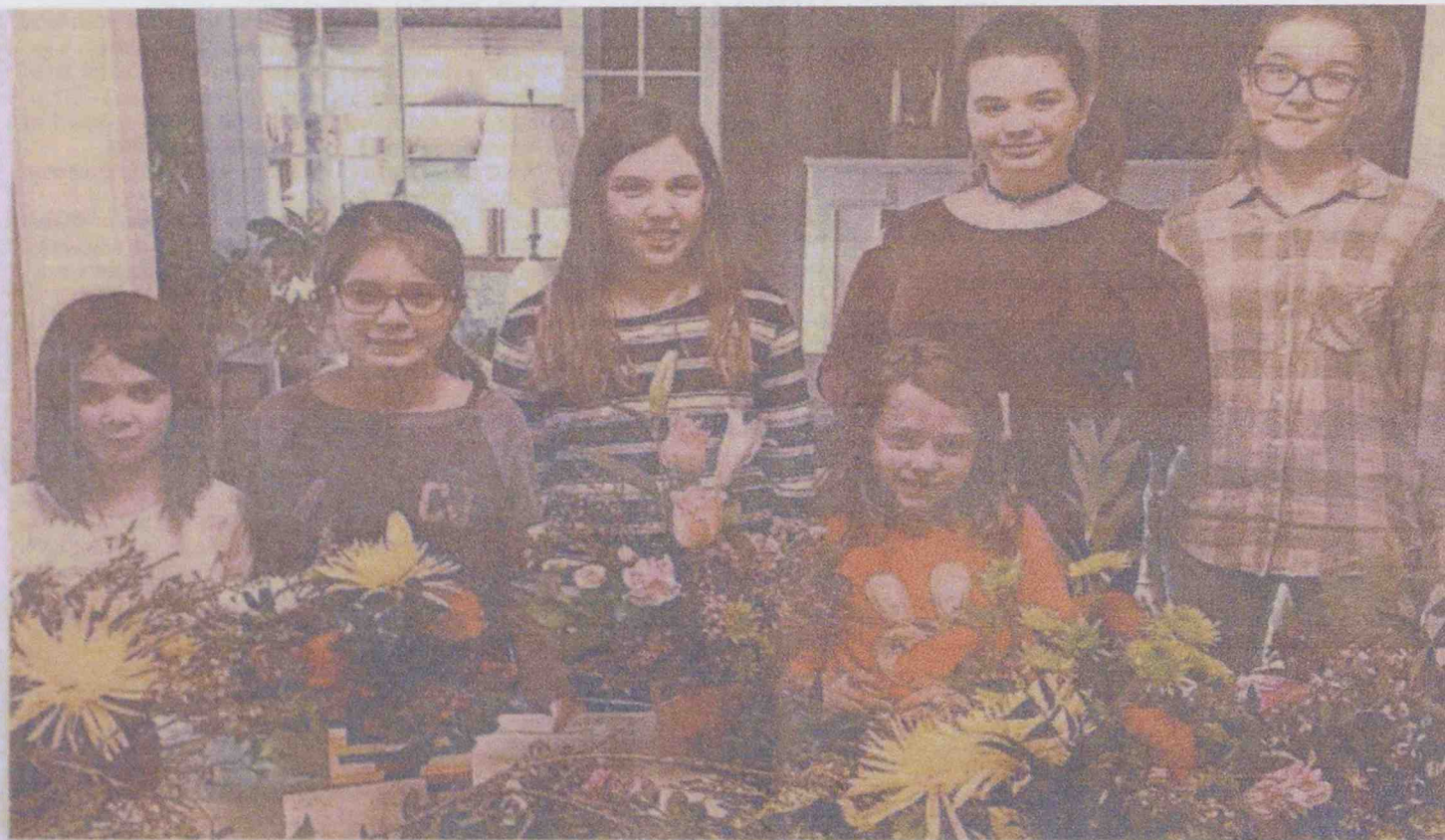
Although faced with significant competition this year from elementary, middle and high school participants from across the state and within specific categories, 11 participating Rake and Hoe youth each won one or more blue ribbons.