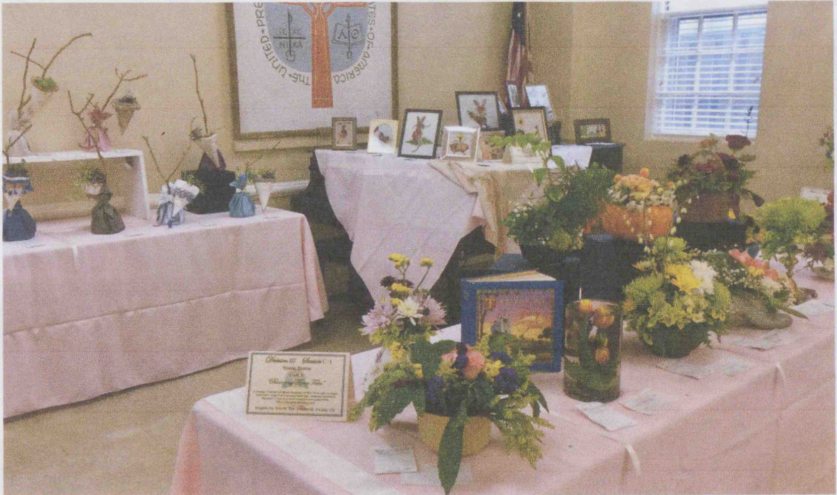
Fairy Tale Flower designs, Tussie Mussies and Dried Flower Art by the Juniors in the Rake & Hoe Flower show in April.