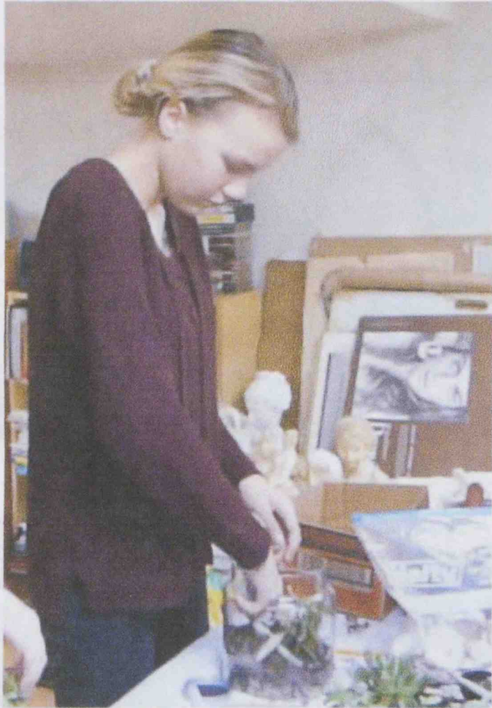
Decorating headbands and planting terrariums for the GCNJ Flower Show