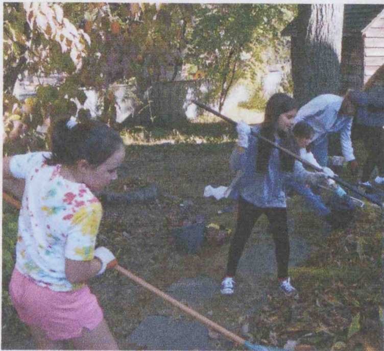
Clean-up of the Fern Garden at the Miller-Cory Museum. Then the juniors collected ferns and leaves and learned how to make monoprints with water soluble inks and rollers.